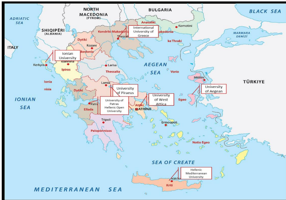
Map (1): Undergraduate tourism departments 2018-2021 Source / editing: The authors

allowed. Initially, there were two new undergraduate departments of Tourism Studies, one at the University of Piraeus in Athens (Department of Tourism Studies) and another one at the University of the Aegean, in Chios (Department of Tourism Economics and Management). At the same time, the TEI of Athens and the Piraeus University of Applied Sciences merged and formed a new oversized University under the name of University of West Attica (Law 4521/2018). The merger between the two directions of Tourism & Hospitality Business Administration from the old institutes, resulted in the operation of a department of “Tourism Management” within the University. The new formation of the current tourism education is interpreted as follows (Map 1):