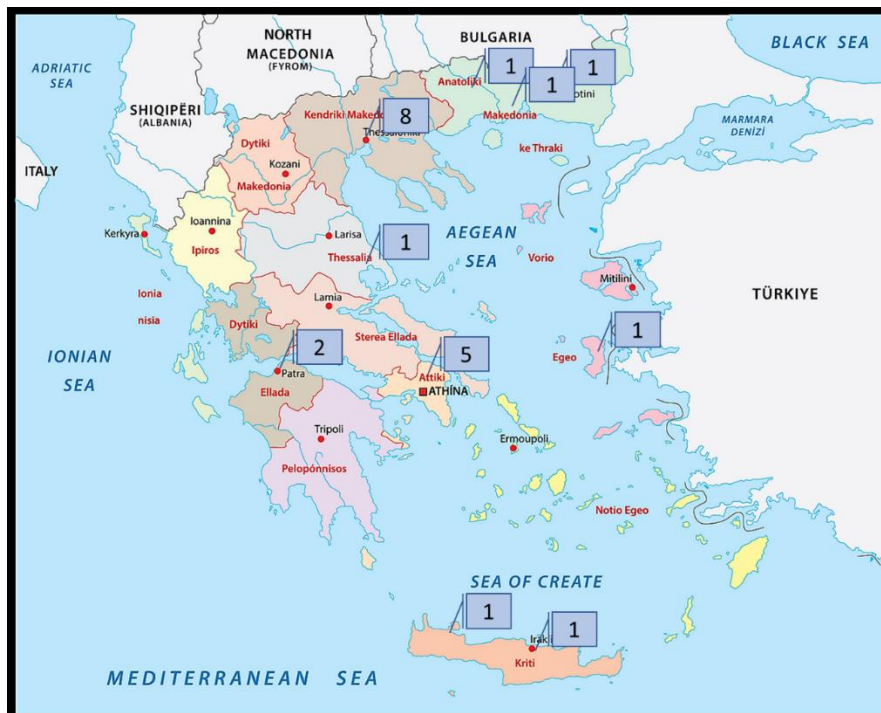
Map (2): Postgraduate tourism programs offer 2018-2021